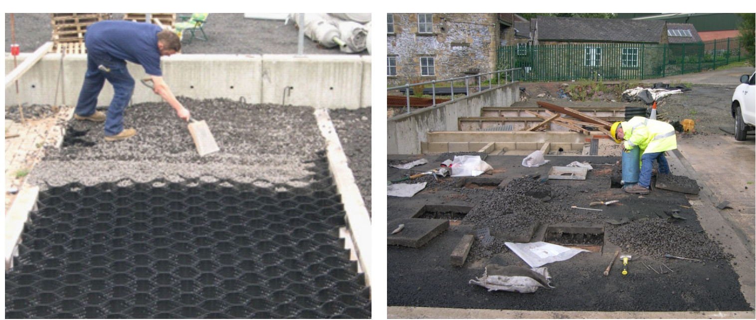
Figure 2 - Cellweb TRP® in construction.

Fact Sheet 1: Use of Cellweb TRP® in Root Protection Areas (RPA's)