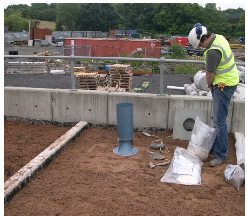
Figure 1 - In situ density test prior to construction of pavement

The use of Cellweb TRP<sup>®</sup> also spreads the wheel loads from traffic. There has been extensive research published on the performance of these systems from the original work by the US Army Corps of Engineers (Webster 1981) to more recent studies such as that by Emersleben and Meyer (2008).